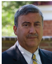
LARRY SABATO Election Analyst and Author, Founder and Director of the U.Va. Center for Politics