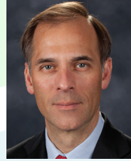
Speaker: MARK ZANDI Chief Economist and Cofounder of Moody's Analytics