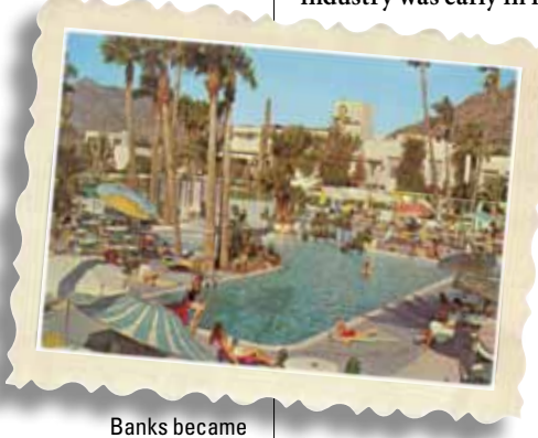
eligible for membership at the 1971 Convention at the Camelback Inn in Scottsdale, Ariz.